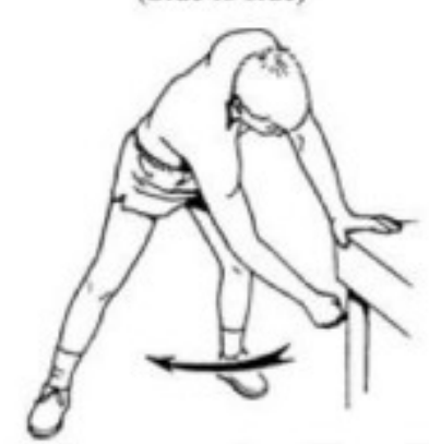
Gently move arm from side to side by rocking body weight from side to side. Let arm swing freely. Repeat 10-15 times. Do 3 sessions per day