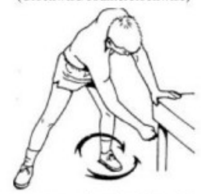
Let arm move in a clockwise circle. then counterclockwise by rocking body weight in a circular pattern. Repeat 10-15 times. Do 3 sessions per day