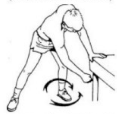
Let arm move in a clockwise circle, then counterclockwise by rocking body weight in a circular pattern. Repeat 10-15 times. Do 3 sessions per day