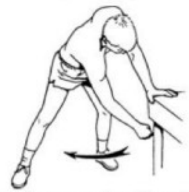
Gently move arm from side to side by rocking body weight from side to side. Let arm swing freely. Repeat 10-15 times. Do 3 sessions per day